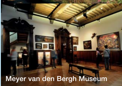
Meyer van den Bergh Museum