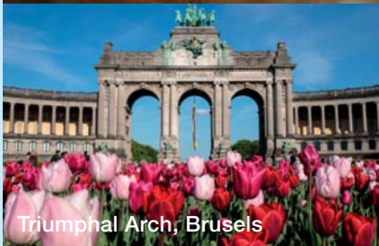
Triumphal Arch, Brussels